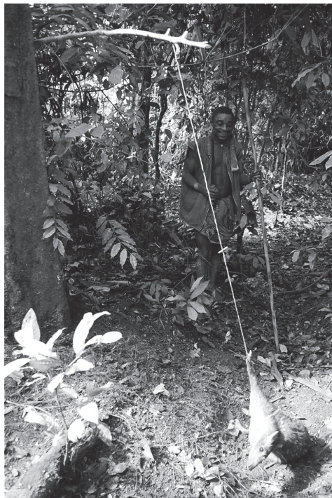
Fig. 2. An animal captured in a snare.

village yielded 662 catches composed of 24 species: 11 ungulates, 5 primates, 5 carnivores, 2 rodents, and 1 pangolin (Table 1). Red duikers comprised 73% (486/662) of the total captures: Peter's duikers ( Cephalophus callipygus ) accounted for 83% (403/486), bay duikers ( C. dorsalis ) accounted for 14% (67/486), white-bellied duikers ( C. leucogaster ) accounted for 2.6% (13/486), and black-fronted duikers ( C. nigrifrons ) accounted for 0.6% (3/486). In addition, 43 (6%) red river hogs, 35 (5%) blue duikers ( Philantomba monticola [syn. Cephalophus monricola ]), and 34 (5%) yellow-backed duikers ( C. silvicultor ) were captured.