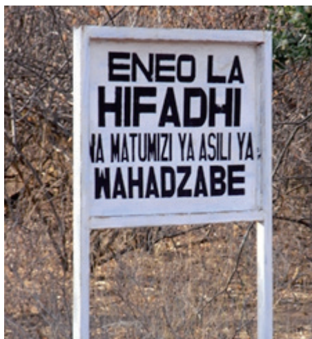
Fig. 3. The sign post erected by the NGO and the Hadza in Yaeda Chini Ward It states “This is the area where traditional natural resource use by the Hadza is protected.”

Another example was in the latest news. Against this background of violations of the Hadza land, the Ujamaa Community Resource Trust in collaboration with the Mbulu District Administration, worked with the local villages and developed a participatory land use zoning and land use plans, backed by legally ratified village bylaws in the southern part of the Hadza’s settlement area (Peterson et al., 2012). Now there are several sign posts with notices written, “This is the area where traditional natural resource use by the Hadza is protected (Eneo la Hifadhi wa Matumizi ya Asili ya Wahadzabe)” in Swahili (Fig. 3). Consequently, in October 2011 the Hadza acquired from the Tanzania Land Commissioner their land title for land encompassing more than twenty thousand hectares in the three villages in Yaeda Chini Ward, to engage in their traditional practices (Dorobo Fund online, 2011). And other areas in the villages also were zoned according to other livelihood activities. This is a very rare endeavor in Tanzania by a specific ethnic